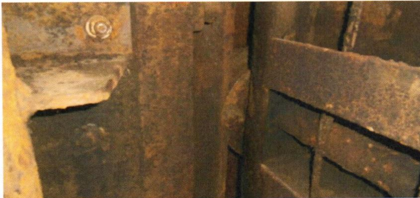
Left: Backside of gate that needs to be replaced